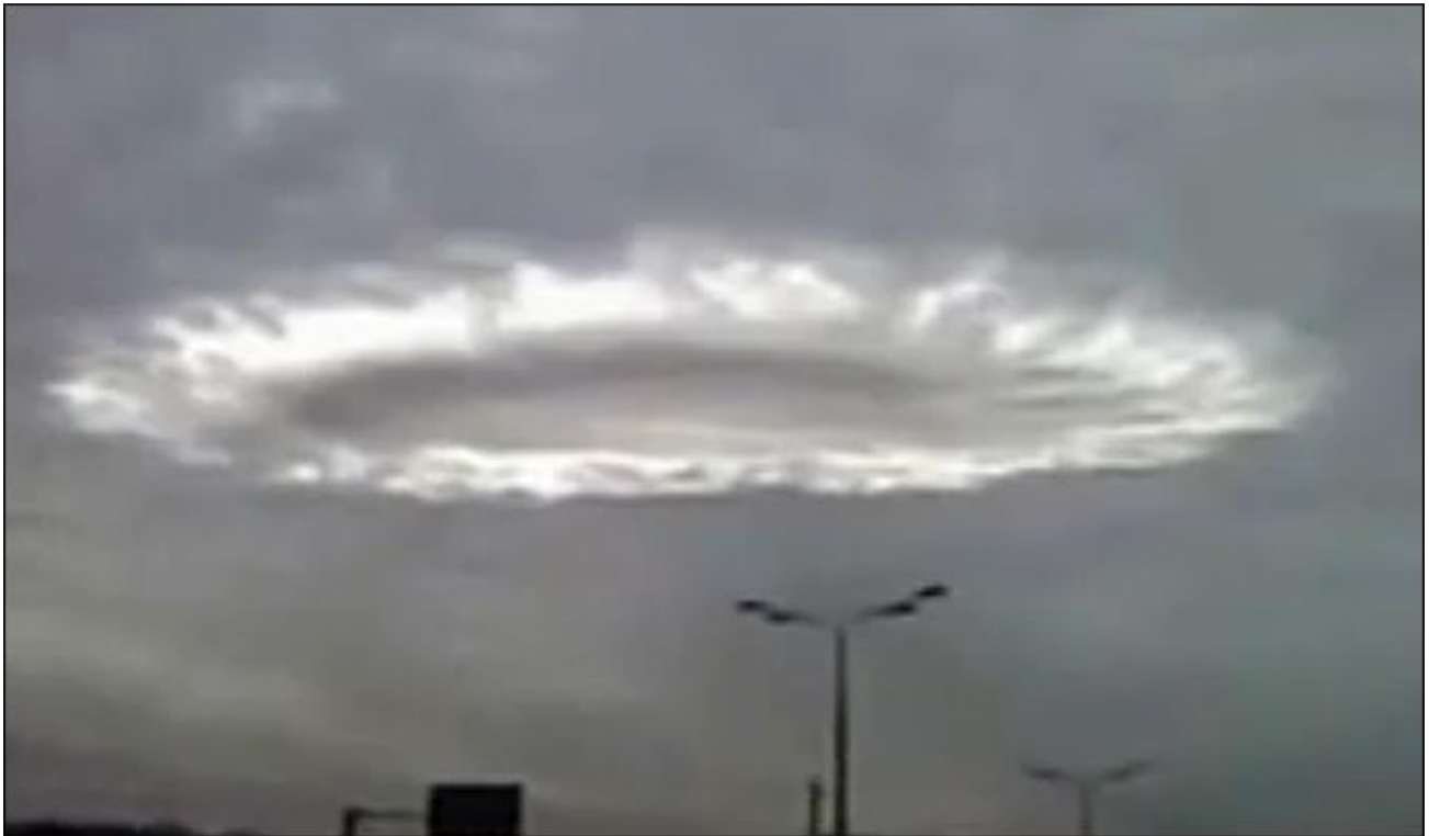
First sighting ... Moscow halo

"Speculation is rife on the internet - aliens, secret weather modification technology, or even some distortion of reality, caused by the Large Hadron Collider."